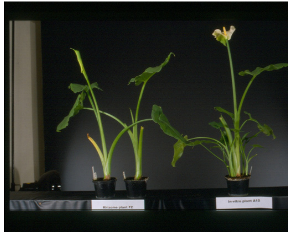
Fig. 1. Left, Rhizome plants; Right, in vitro plants.