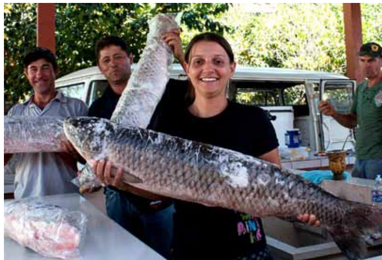
Fish farmers in Brazil

Other aspects of the Programme include: local seminars with tobacco farmers, regular meetings between the projects to discuss associated technical issues, public hearings on legal issues, participation of smallholders in fairs and exhibitions to advertise the Programme, intersectoral actions with participation in the Interministerial Commission for the Implementation of the FCTC (CONICQ), training courses in public policies to support diversification in tobacco cultivating countries, conducting public calls for the hiring of contractors and training of ATER projects, creation of the initiative "Fostering sustainable rural development in tobacco areas" 9 to financially support the actions of the Programme, with a minimum of 1 million Reais (€ 400,000). The Programme also works in collaboration with universities to develop research on diversification in tobacco growing areas.