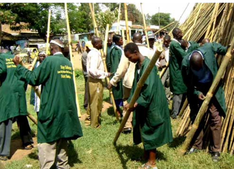
Bamboo utilisation workshop, Kenya

Most farmers in the country started tobacco-farming activities either because they anticipated a ready market (23.4%), incentives from tobacco companies (19.7%), influence from other farmers (18.4%) or lack of a viable alternative cash crop (16.8%). Most farmers (16.5%, 21.5%, 6.7% and 12.2%) continue growing tobacco because of its alleged high financial benefits, ready market, availability of loans in form of farm inputs and favourable climatic conditions, respectively. An estimated 8.0% continue to grow the crop so that they clear pending debts from previous years.