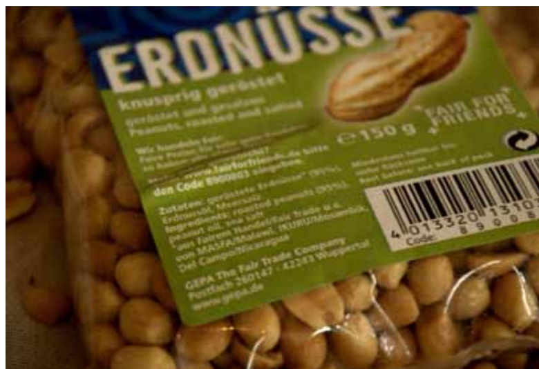
Fair trade groundnuts from MASFA

In Brazil, the Centro de Apoio ao Pequeno Agricultor (CAPA) 40 supports a model based on agro-ecological production. They provide technical training on multi-crop cultivation and organic fertilisation, enabling smallholder families to practise an alternative type of agriculture in comparison to chemical intensive monocropping. 41 The organisation is active in southern Brazil, where the biggest tobacco producing states 42 are found. In Rio