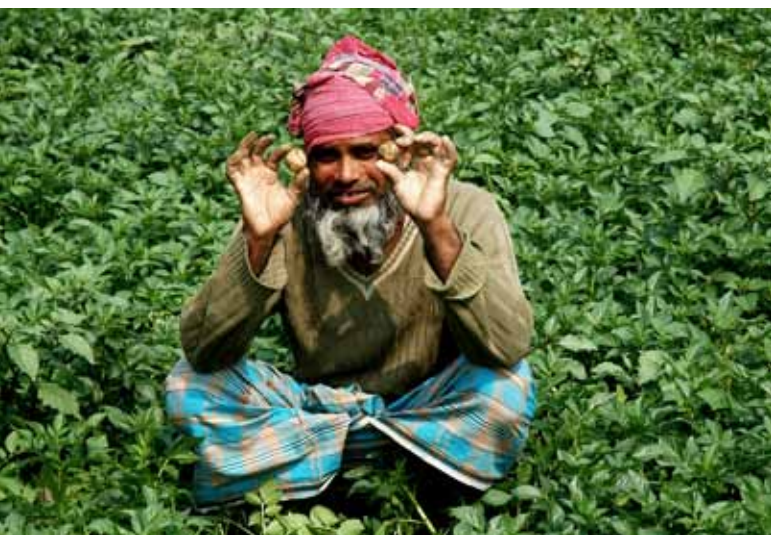
Potato field in Kushtia, Bangladesh

decision and they were searching for a way out. Direct experiments at the field level in the three research areas were first carried out to find out the proper substitute crop for replacement of tobacco during the season when tobacco is grown. The villages, where tobacco is grown extensively, have lost crop diversity, particularly in terms of food crops. However, the replacement of tobacco by substitute food crops involved a lot of issues including i. land selection, ii. cropping plan iii. seed management and land