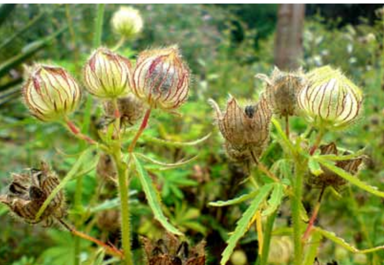
Kenaf: just another monocrop?

It is precisely for lack of loans, extension services or guaranteed markets that farmers have been either unable to switch or reluctant to do so. 5 Organisations working on issues involved in tobacco farming have recognised these aspects as key action areas for projects that wish to support alternatives. 6 Most of the projects reviewed in this study have been particularly active with regards to the last two aspects: agricultural extension services and strengthening of market opportunities. UBINIG and Nayakrishi Andolon have facilitated access to seeds as well as provided knowledge on multicropping and pesticide-free agriculture. MASFA in Malawi guarantees to buy the groundnuts produced by its members. Brazil's National Programme for Diversification in Tobacco Growing Areas has worked in all three areas: providing financial support and extension services as well as securing markets for farmers. 7